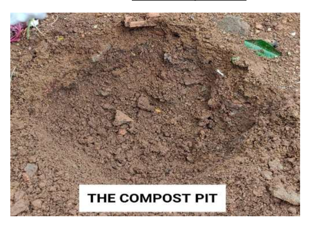
The Compost Pit

Compost pit humus can be beneficially used to improve the quality of soil. They add nutrients and organics and improve the soil's ability to store air and water. Especially vermicompost improves the