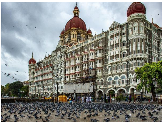
Taj Mahal Palace, Mumbai

Jamsetji Nusserwanji Tata, founder of the Tata Group, opened the Taj Mahal Palace, a hotel in Mumbai (formerly called Bombay) overlooking the Arabian Sea, on 16 December 1903.