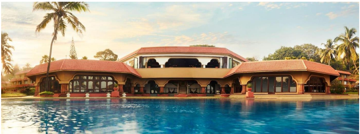
Fort Aguada Beach Resort in Goa

In 1974, the group opened India's first international five-star deluxe beach resort, the Fort Aguada Beach Resort in Goa.