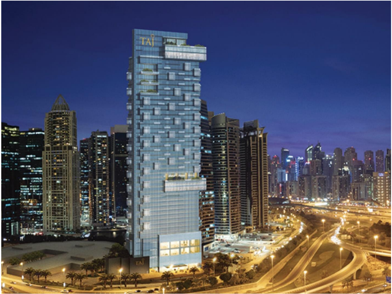
Taj Jumeirah Lakes Towers Dubai

group. Other properties of the group include Taj Jumeirah Lakes Towers Dubai and Taj Dubai.