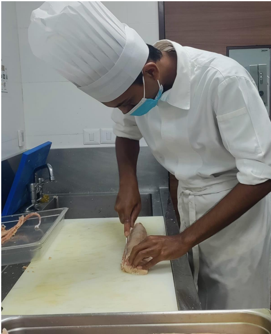
Me deboning a fish

Only the beginning was a bit hard to cope up with everything but once u got used to doing it every day it becomes way easier.