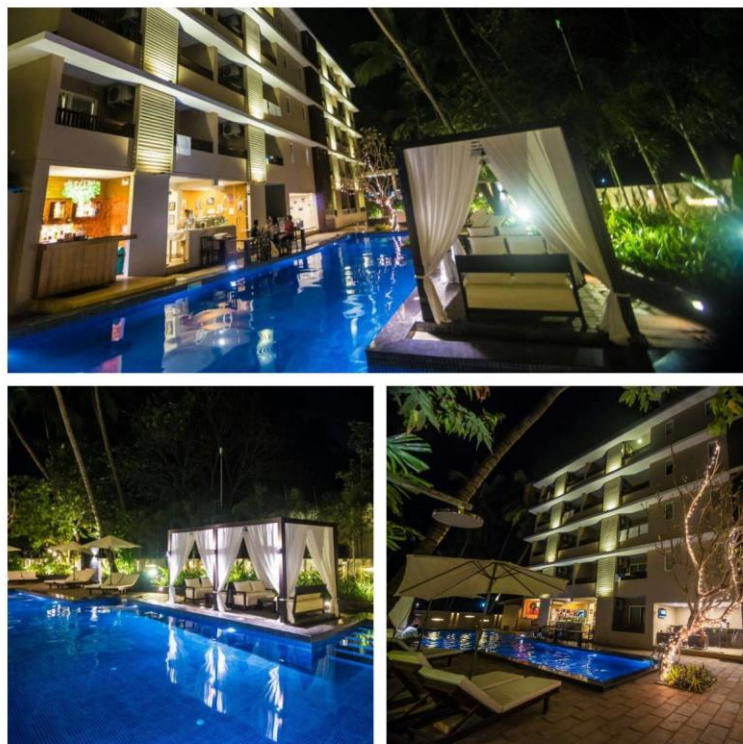
SINQ Signature Candolim