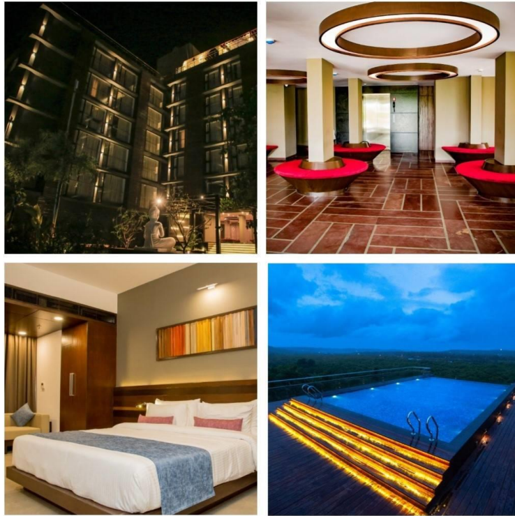
SINQ Prive Candolim