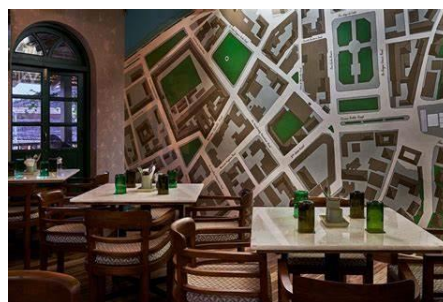
SOHO The Capital Bar