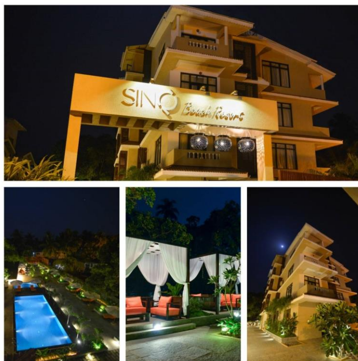
SINQ Beach Resort, Calangute