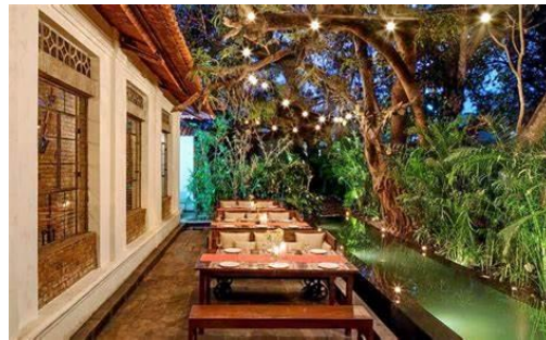
SORO The Village Pub