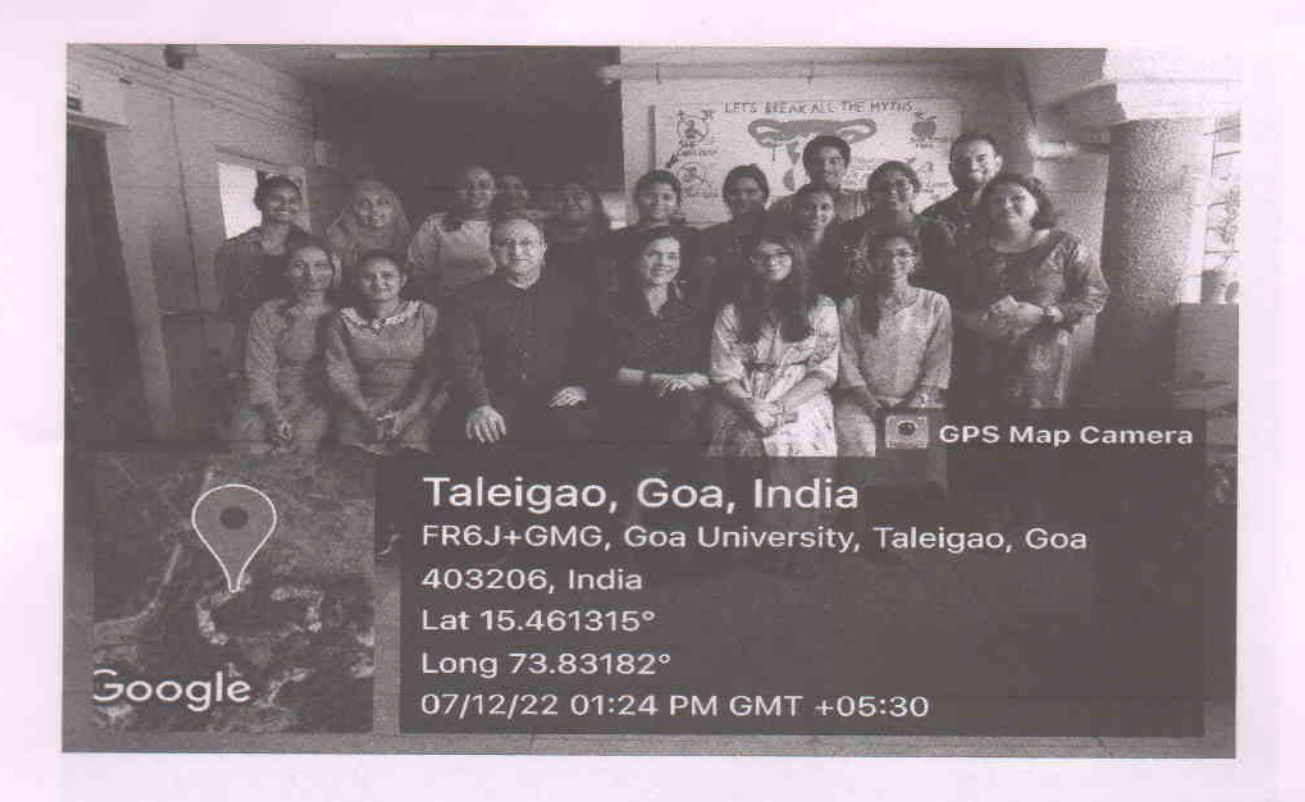
Figure 2 Speaker discussing about the counselling techniques