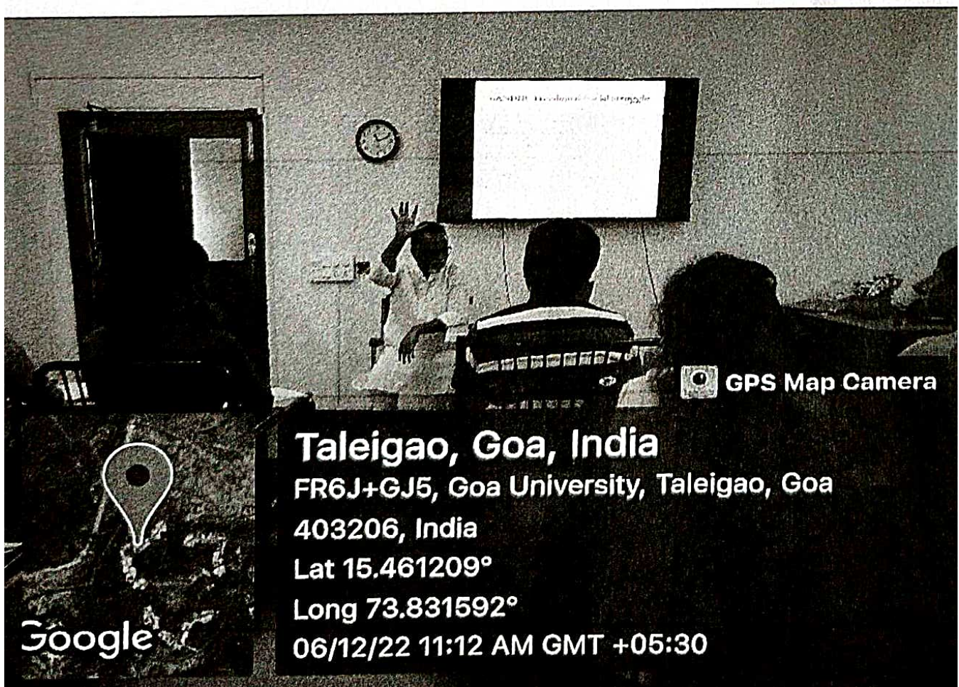
Figure 2 Speaker discussing about the Gandhian approach