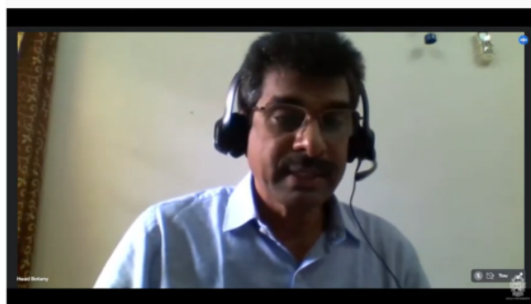
National Webinar On Advances in Plant Science - DAY 2