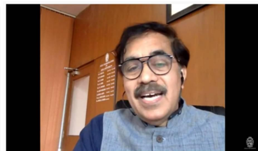
National Webinar On Advances in Plant Science

1,492 views • Streamed live on Feb 3, 2022