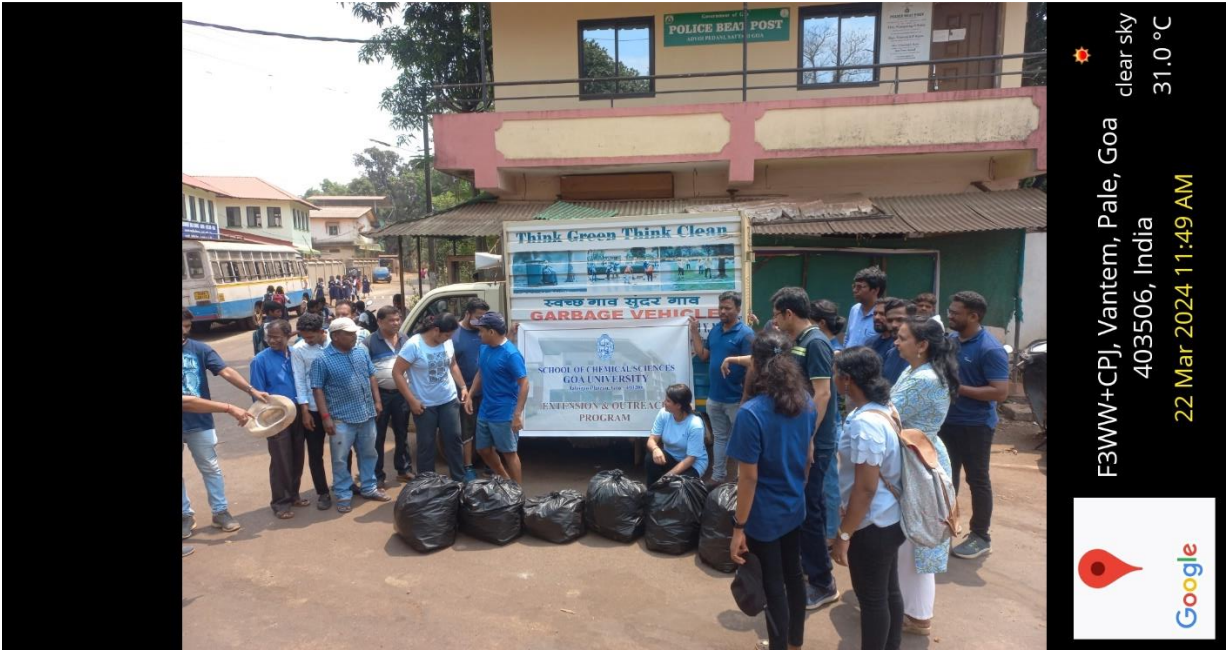
Cleanliness Drive at Advai-Peddyem Junction on 22-03-2024