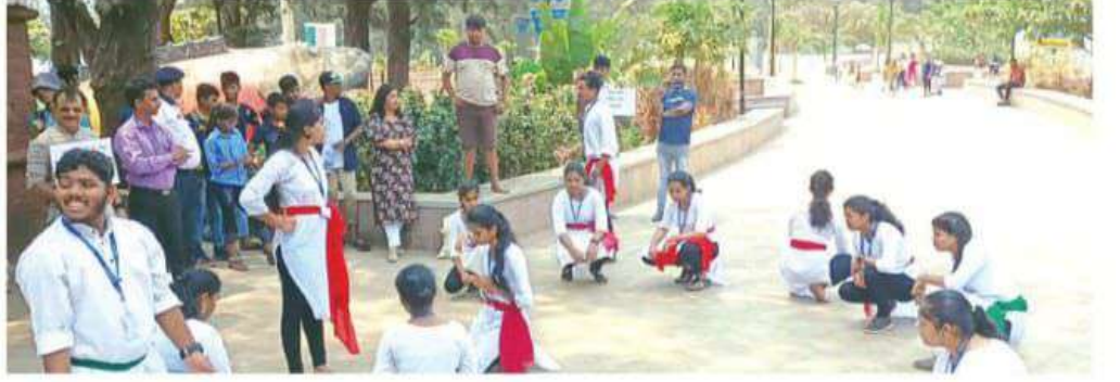
गोंय विद्यापीठाचे विद्यार्थी रस्तोनाट्य सादर करतना.