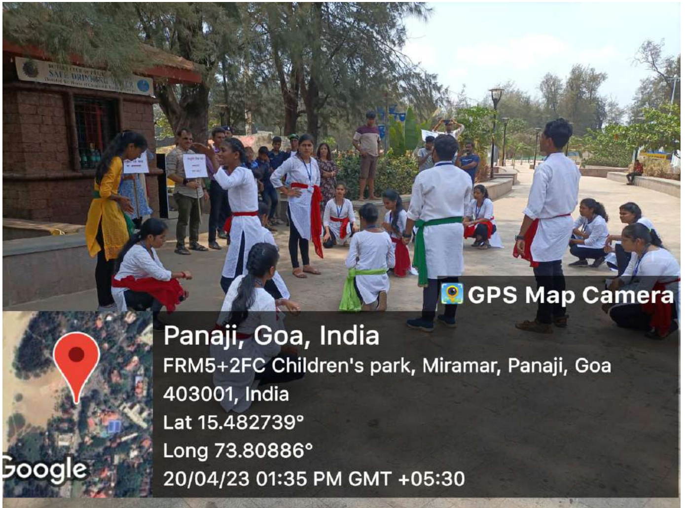
Street Play on Road Safety at Children's Park, Near Panaji Bus Stand, Panaji on 20-04-2023