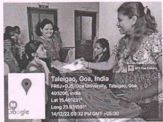
Image 4. Stall put up by Kiran Niketan