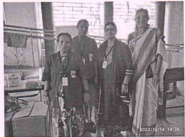
Image 6. Wish Team along with Dean of MPS