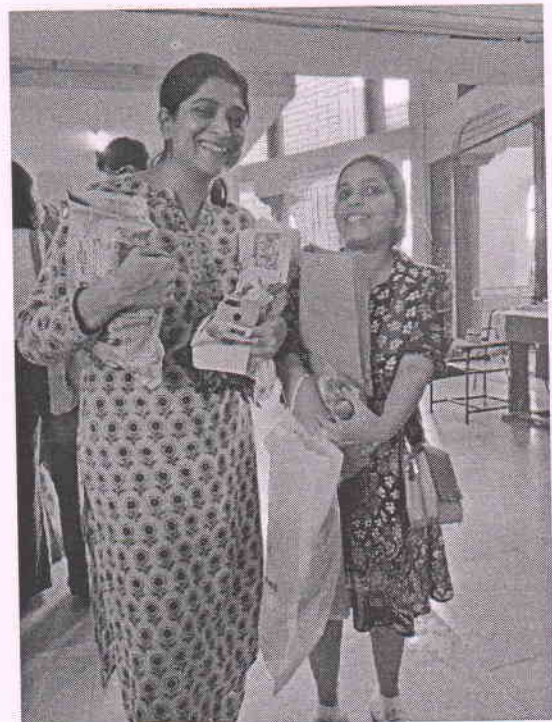
Image 2. Happy buyers