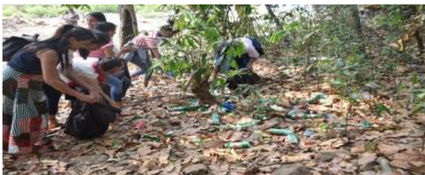
CLEANLINESS DRIVE AT USTEM DAM