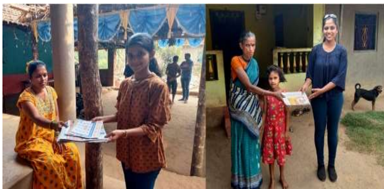
Students interacting with the villagers