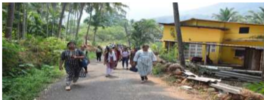
IN A VILLAGE NEAR FOOT CANAL BRIDGE