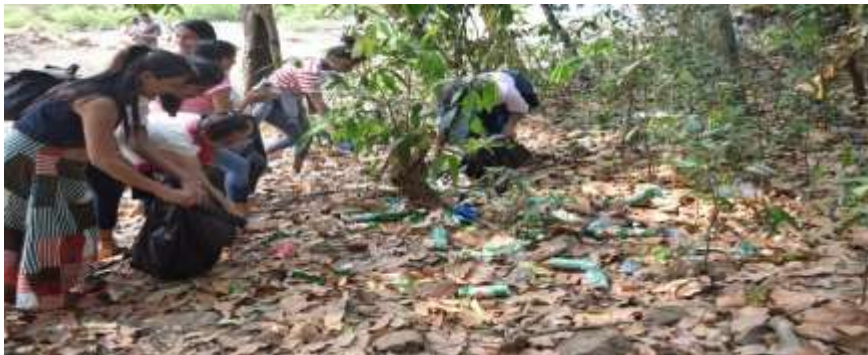
CLEANLINESS DRIVE AT USTEM DAM