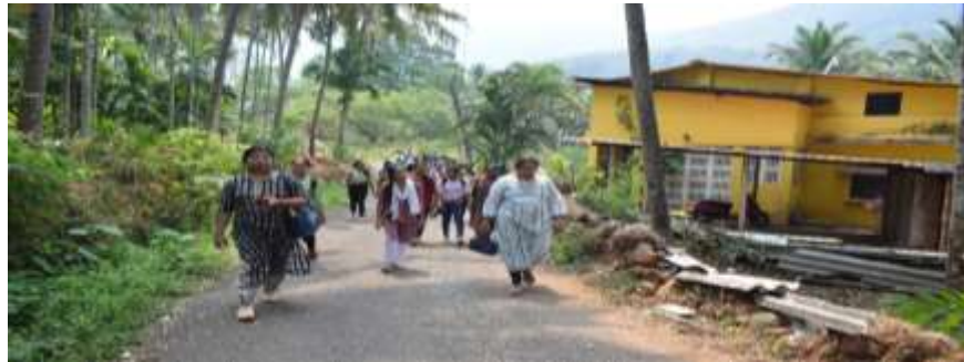
IN A VILLAGE NEAR FOOT CANAL BRIDGE