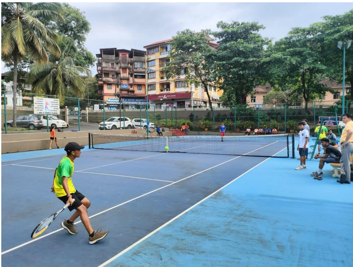
B.P.S Sports Club, Margao