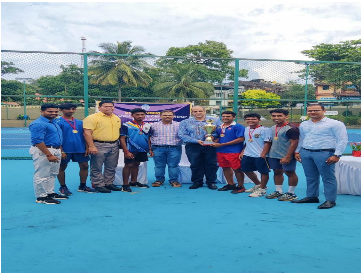
Winners men's:- Dhempe College of Arts & Science, Miramar