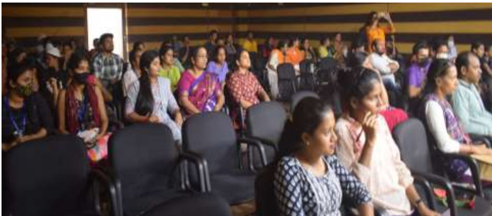
AUDIENCE ENJOYING THE STUDENTS PERFORMANCE