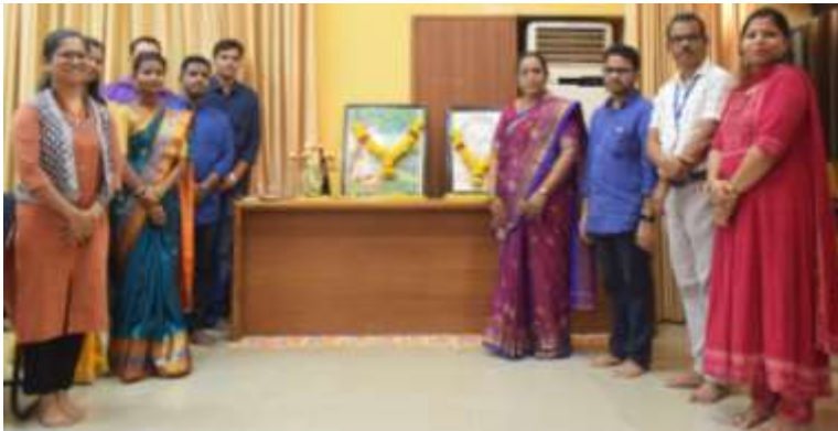
LIGHTENING OF THE LAMP & GARLANDING PORTRAITS