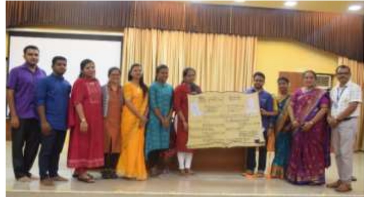
INAUGURATION OF WALLPAPER MADE BY STUDENTS