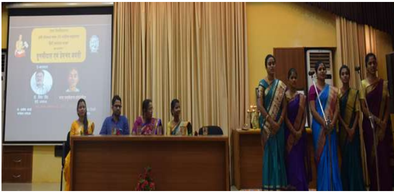
INAUGURAL FUNCTION – WELCOME SONG BY STUDENTS