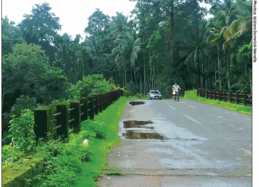
NIRANKAL-DABHAL BRIDGE: Enveloped with a thick cover of coconut palms is the 1972 bridge built over the Unnas. It connects the village at Taribhat to Dabhal in Dharbandora taluka.

The lab assistants have been told to attend the monthly staff meetings of their schools and help in the procurement of lab equipment in consultation with the school science teacher and the head of the institution. "They have to maintain all of the laboratory equipments, carry out labelling and arrangement of class-wise practicals and activities in consultation with the school science teachers.