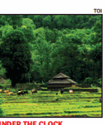
UNDER THE CLOCK

The committee has been created to finalise the report on private forests which was submitted by the review committee. The review committee had been constituted on April 23, 2019, after consideration of the objections of