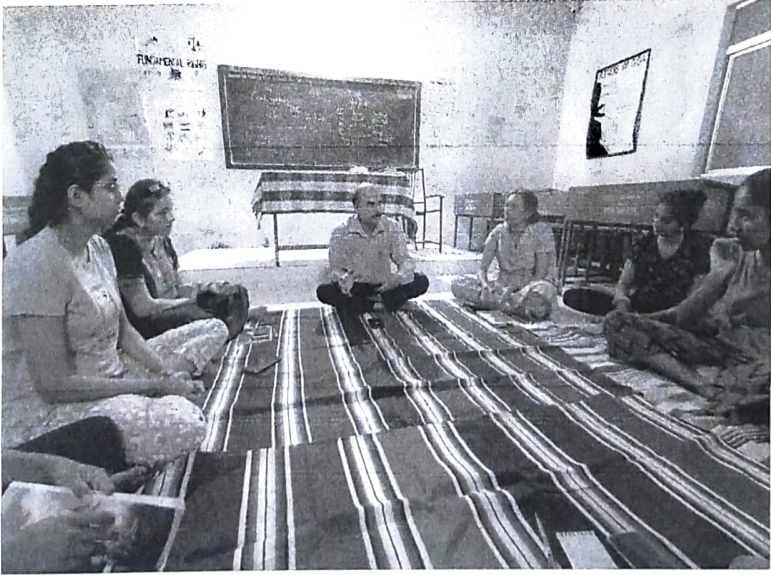
Photograph 8 Interaction with Dr. Sachin Tendulkar