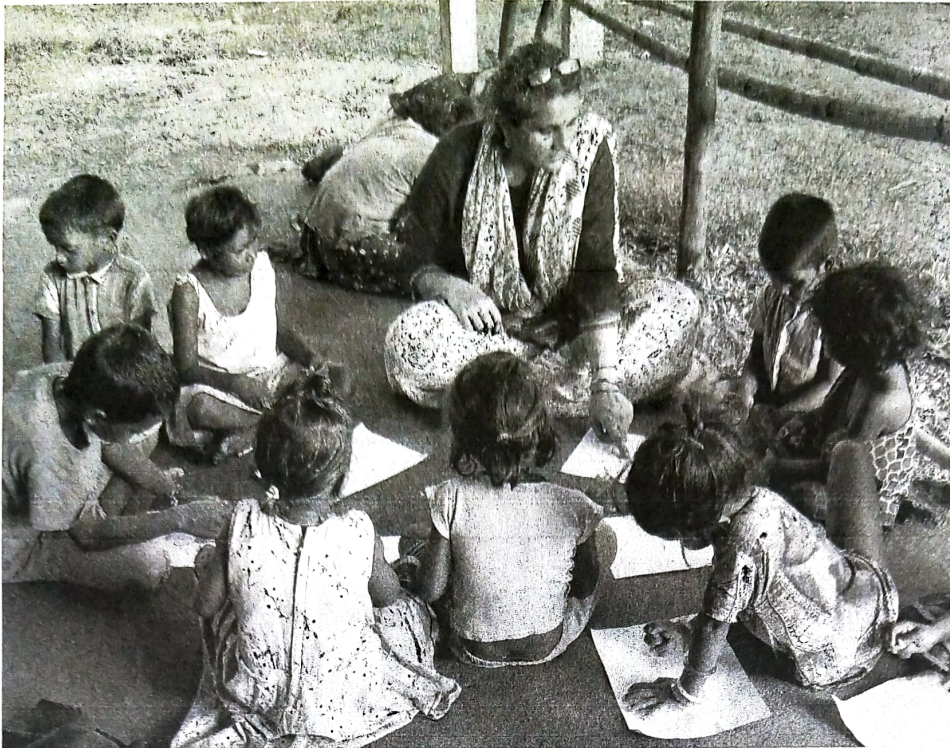
Photograph 2 Drawing with Kids of Vanarmare community