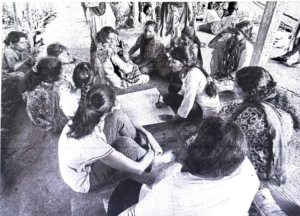
Photograph 3 Social Mapping with women from Vanarmare community