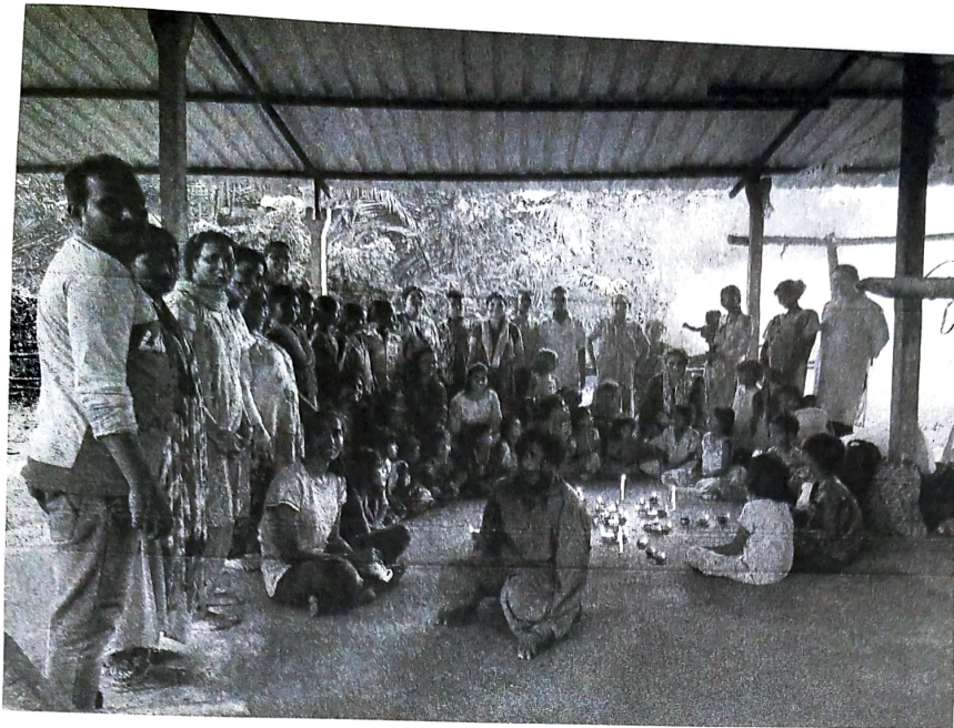
Photograph 5 Lighting of Dias with Vanarmare community