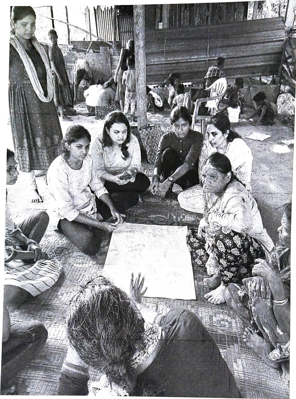
Photograph 4 Social Mapping with women from Vanarmare community