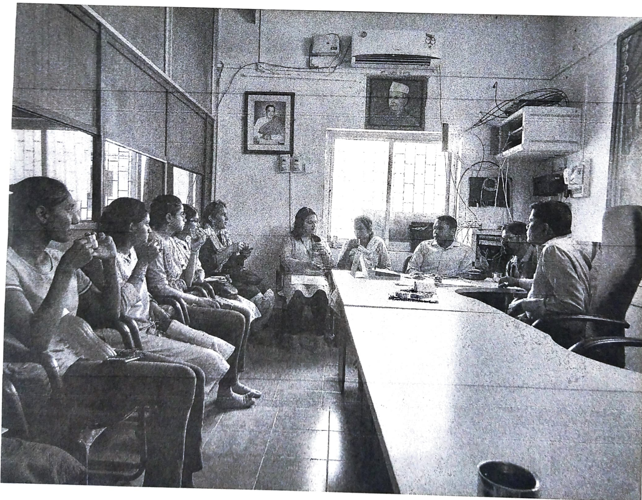
Photograph 1 Interaction with Panchayat Members