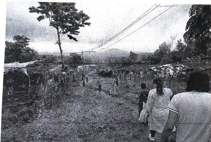
Photograph 6 Visiting homes in the Vanarmare community settlement